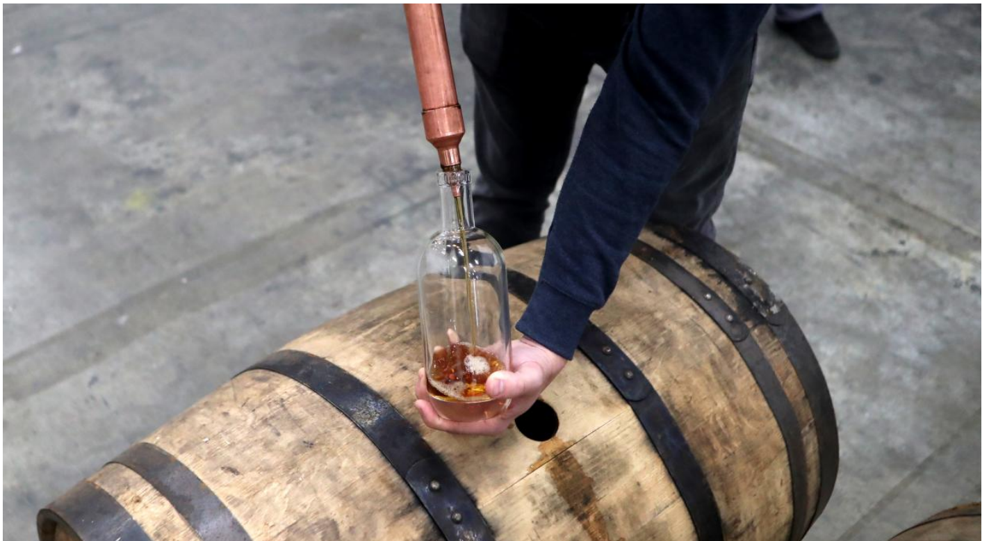
The bottled up a version of Pursuit Spirits at the media preview of the launch of their two new behind-the-scenes distillery experiences. Dec. 7, 2023

More: Kentucky bourbon tourism has record year, with $2.1 billion in investments. What that means